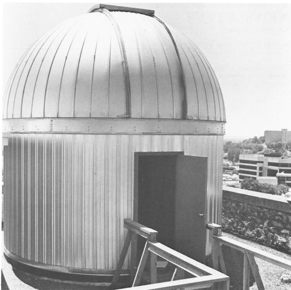
The new sixteen foot Ash Dome and wall cylinder houses the 6-inch Clark refractor. Installation was completed in early June, five years after the old structure was condemned as unsafe. This Ash dome is fully electrical.

Steven A. Hawley (B.A. Physics and Astronomy 1973) has been selected as the fourth crewman for Shuttle 12 mission. He recently married Dr. Sally K. Ride, an astronaut assigned to fly Mission 7.